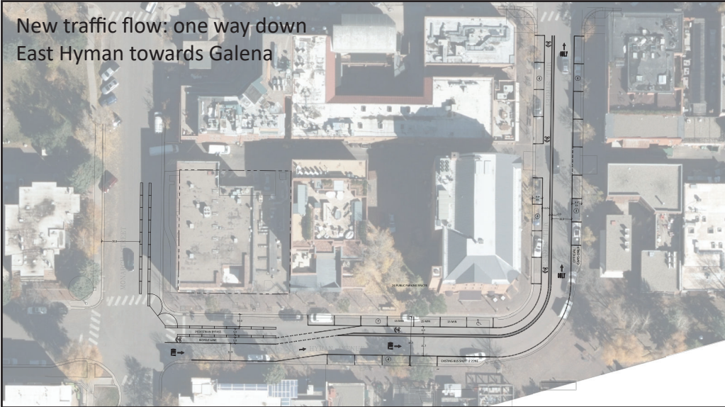
SITE LOGISTICS PLAN