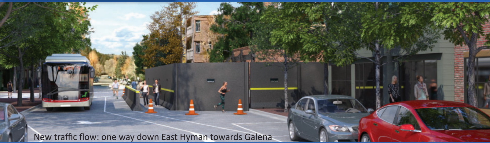
New traffic flow: one way down East Hyman towards Galena